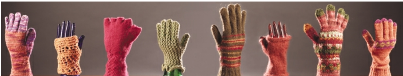
Gloves, from left to right, were made by: Susan Sternlieb, Kate Wetzel, Leigh Radford, Ann Budd, Ivy Bigelow, Cyrene Slegona, Pam Allen, and Lori Gayle.

Knit 1 row. Shape thumb: [Ssk] 2 times, k28, [k2tog] 2 times—32 sts rem. Next row: K16, use backward loop method to CO 4 sts over gap, k16—36 sts. Knit 2 rows even. Work lace pattern for 6 rows. Work garter st for 5 rows. BO all sts kwise. With yarn threaded on a tapestry needle, sew side seam. ∞